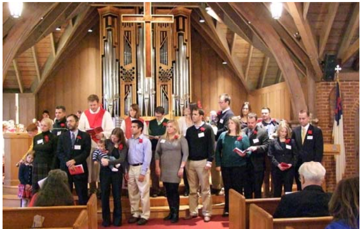
Did we mention in the last newsletter that all of these people joined in October? Welcome!

Dates for Midweek Advent Services are: November 30, December 7 and December 14. Please note: Midweek Advent services will not be preceded by dinner this year.