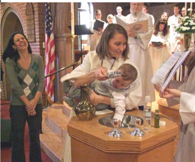
Baptism is truly a joyous occasion at Faith.