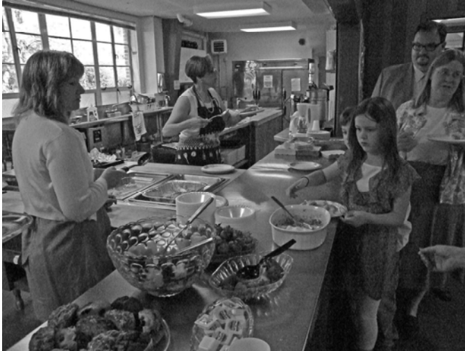
Baskets and Bonnets!