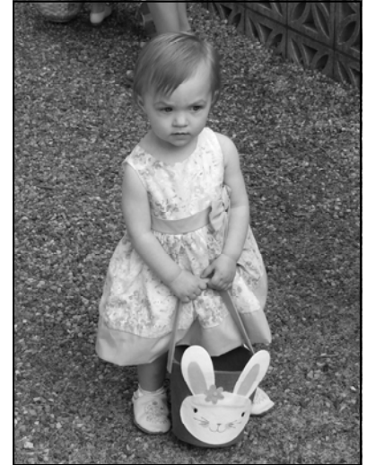
Fashion reel from the 2011 Faith Lutheran Easter Egg Hunt