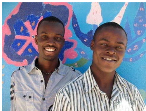
University Scholarship recipients.