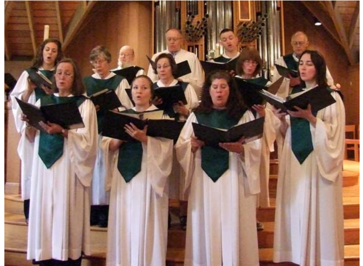
Below: The choir kicked off a new season at the 11:00 service on September 11. The choir is always looking for new singers! Rehearsals are on Wednesdays at 7:45 p.m.