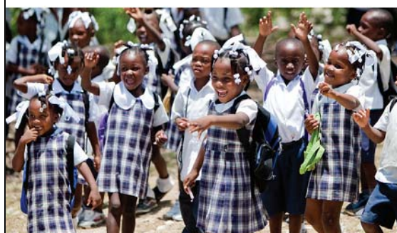
Village of Hope school children.

After visiting several ministries, all desperately in need of assistance, the group decided to focus on a ministry called the Village of Hope in the Ganthier region 15 miles east of Port au Prince. Village of Hope is a school founded by the late missionary, Carol Herget. Its eight buildings provide 17 classrooms, kitchen, dining hall, chapel, showers and toilets, vocational school facilities, offices and storage on 30 acres of land. They offer ample space for educational and religious activities for the 640 children now enrolled, all of whom have access to two meals per day.