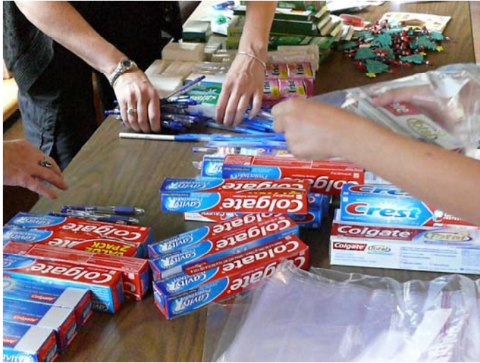
Above: Members of Faith illustrate the ELCA slogan, "God's work, our hands," while assembling Christmas Kits on August 28 that will be sent to Haitian children at the Village of Hope school.