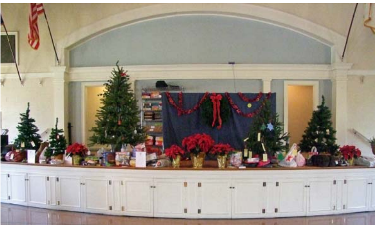
Angel Trees, crowded with gifts, adorned the Fellowship Hall stage throughout Advent and Christmas.