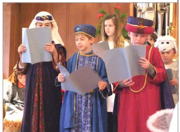
Three wise men came to worship Jesus.