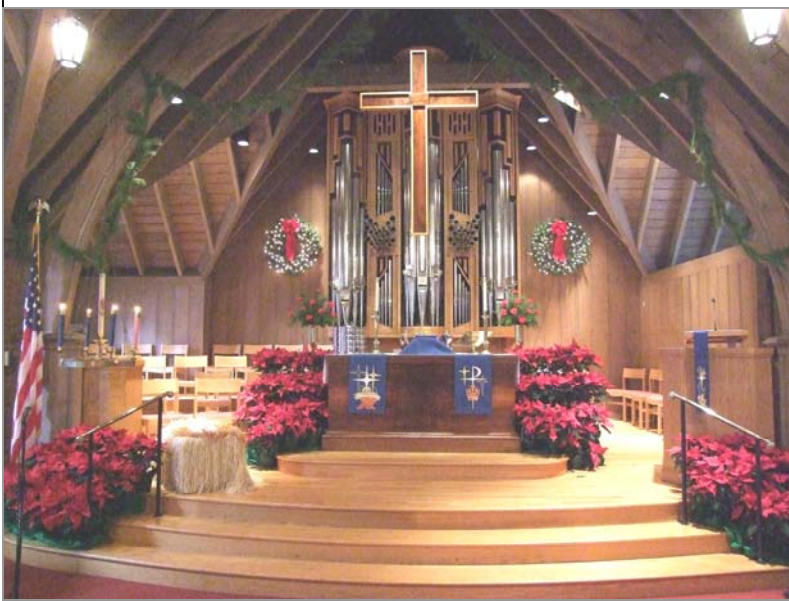
Stars, Angels, Shepherds, Kings! The children's Christmas Program was a big hit.