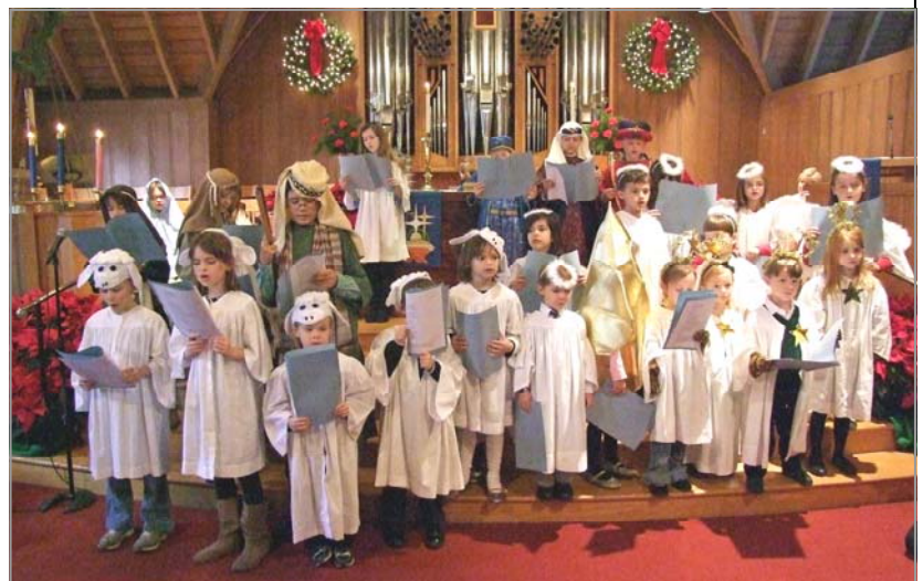
Sheep, shepherds, angels, stars and Magi sing His praises.

Below: In December, youth assembled Christmas presents for our homeless neighbors. These bundles of candy and pocket crosses were delivered during Faith's monthly bagged meal and clothing distribution, bringing a dose of goodwill and a message of hope to people who need it most.