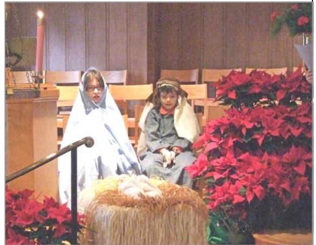
Mary and Joseph marvel over Jesus.

Above: The sanctuary was decorated with wreaths, poinsettias and pine boughs for Advent and Christmas. Each of these decorations were purchased by members of Faith in honor of loved ones, making them not just a delight to the eyes (and noses) of parishioners, but also a testament to the wide-reaching arms of this community of faith.